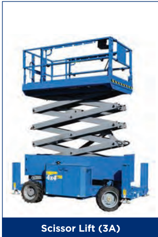
Scissor Lift (3A)

£290.40 (price includes VAT and Test Fee)