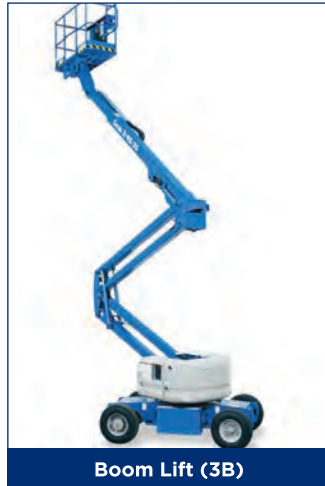
Boom Lift (3B)